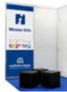
wall element - printed