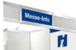
panel - printed