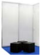
wall element - white

Illustrations of all items you can also find on our homepage – www.mattfeldt-saenger.de/Messebau