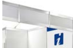
panel - white