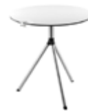
table premium Milano