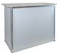
counter - white

Illustrations of all items you can also find on our homepage – www.mattfeldt-saenger.de/Messebau