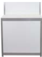
TV wall console