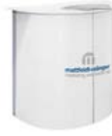
counter half-round – printed